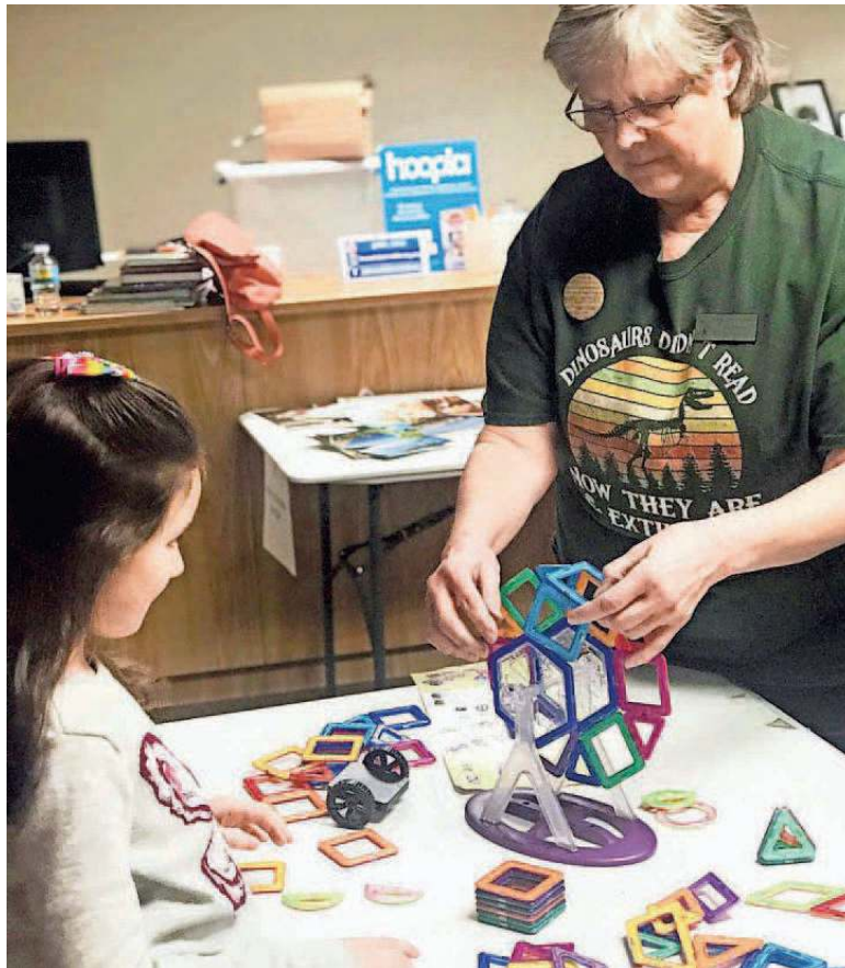
Fun, educational activities are part of “Take Your Child to the Library” on Feb. 5. PROVIDED

Coldwater Daily Reporter USA TODAY NETWORK